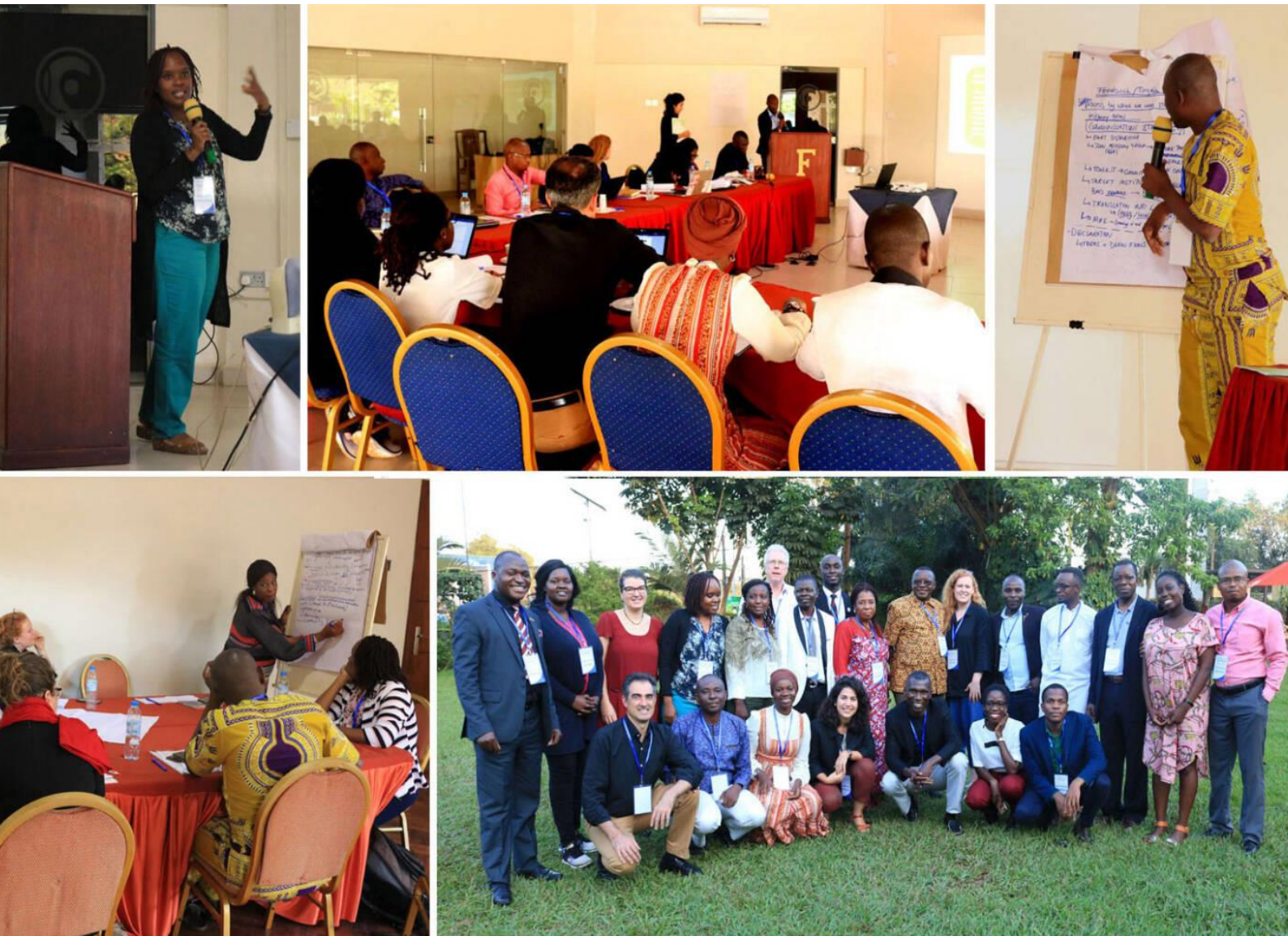
Impressions from the Kampala Workshop, November 2019

Our first “annual report” takes up the structure of this initial work plan.