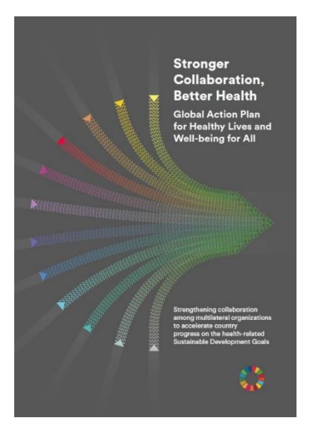
Figure 1: Cover of the GAP document

In this sense, the paper can be seen as a starting point for 'Watching the GAP'. Firstly, we review how this global plan fits with national health policies and ownership, and global health governance (chapter 2) and provide some reflections on the GAP and civil society (chapter 3). Subsequently, we look at the GAP as a normative instrument and compare it with the track record of some of the GAP's signatory agencies (chapter 4). We ask whether the GAP will make any difference to the existing power imbalance and determinants of health and, if so, if it is for better or worse (chapter 5). Finally, we link the GAP to the current COVID-19 pandemic (chapter 6) and end with our conclusions (chapter 7).