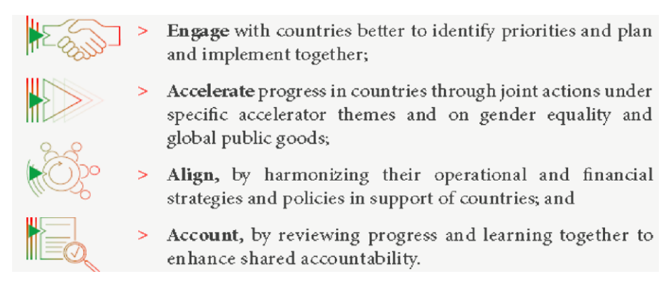
Figure 3: Illustration of four commitments of the GAP agencies to guide implementation of the Plan (from page 26 in the GAP document)

To reflect upon the three GHIs' approach to the four strategies of the GAP - i.e. engage-acceleratealign-account - we will briefly look into their joint action plan and their individual track record.